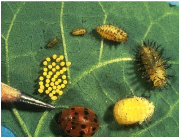
Mexican bean beetle life cycle

These are the beetles as eggs, young, and adults