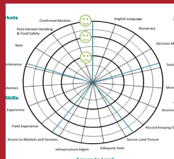
FARM SKILLS ASSESSMENT WEB