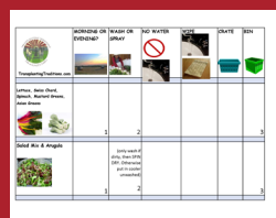
POST-HARVEST HANDLING CHART FROM TRANSPLANTING TRADITIONS, NC