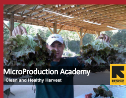
CLEAN & HEALTHY HARVEST PPT