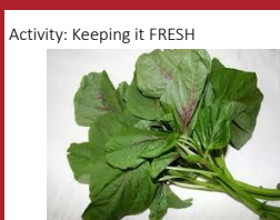
KEEPING IT FRESH PPT