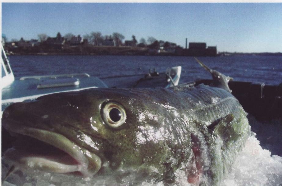
This Atlantic Cod is just hours away from somebody's dinner plate thanks to Cape Ann Fresh Catch of Gloucester, one of the first community-supported fisheries in the country.