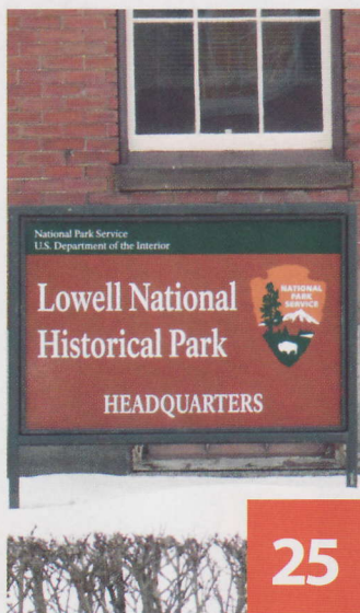
National Park Week is April 22-26.