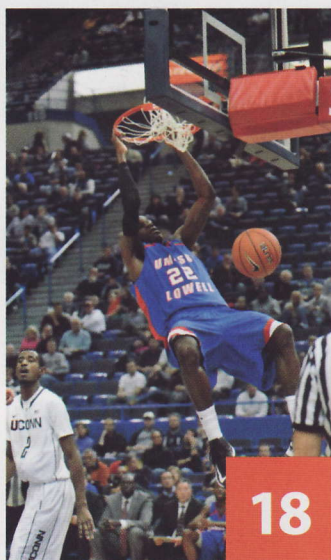
River Hawks to Division I athletics.