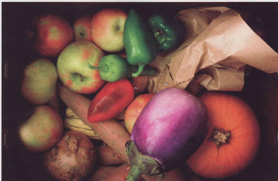
The World PEAS CSA offers members an eclectic mix of fruits and vegetables all season long, from the typical to the exotic.